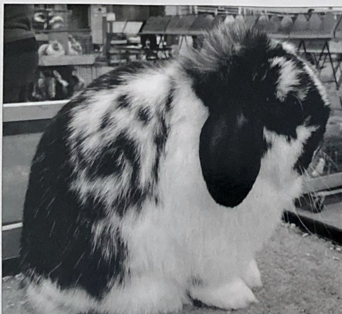
Schwandt/Herioux Jacky - 5S123