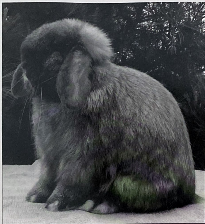
BHH Finn - B71