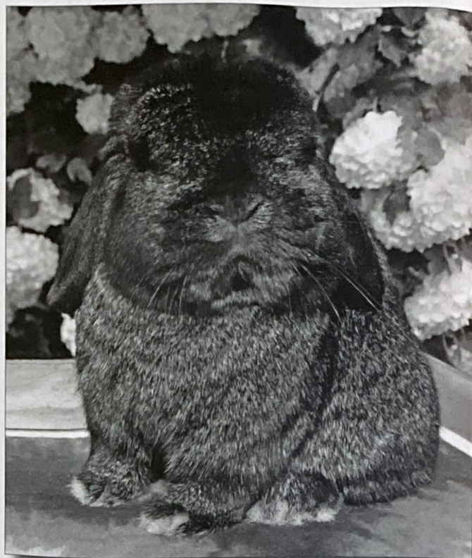
JC'S Goldrush - JC67 oux JR - 5S162

Congratulations to all the Top Lop winners in youth and open.