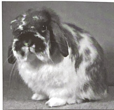
Brocks Fallen Ear's Warren