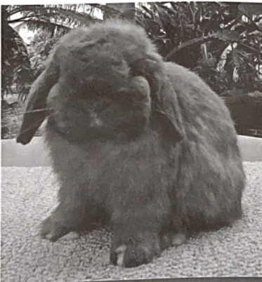
Brocks Fallen Ear's Whiskey Pete

This past year has been gratifying for us, as our herd is becoming more consistent in the level of Hollands we are producing, and this is reflected in our achieving Herdsman for the 4th year in a row.