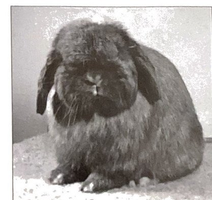
Brocks Fallen Ear's Colorado