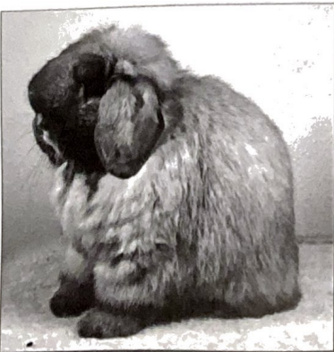
Brocks Fallen Ear's Cover Girl