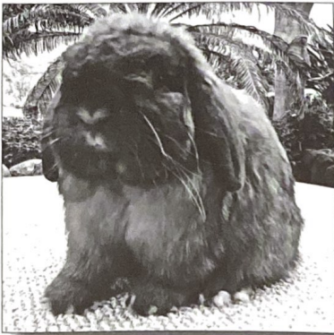
Brocks Fallen Ear's Cimmaron