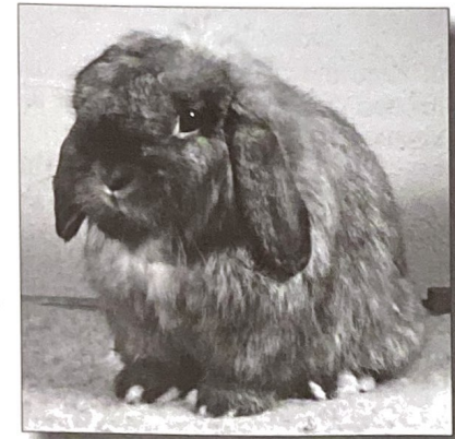
Brocks Fallen Ear's Styverson

We are truly blessed to be a part of this hobby in which we share a passion with so many wonderful people.